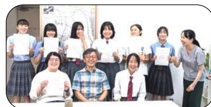
2024 August, High School Sts. Workshop

2024, we gathered high school students and held the 'International Seminar 'The World and Me' - Know, Think and Act. -High School Students' Workshop'. The students presented what they had researched about the problems facing the world and engaged in activities to communicate their opinions and ideas through discussions. In addition, we organized lectures by a certified NPO in Yamagata and on SDGs by a lecturer from the Fukushima SDGs Network. The participating high school students became interested in SDGs and international cooperation, saw global issues as their own affairs, and were motivated to do what they could for the future. A JICA Overseas Cooperation Volunteers consultation desk was also set up for those interested in joining, where I introduced my activities and gave details of the application process. I feel that I was able to plant the seeds of interest for young people and push those who should become more involved to take the next step towards international cooperation.