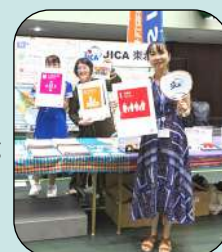
2024 October, International Festival

I hope that many people will utilise the JICA Overseas Cooperation Volunteers system in the future and spread their wings from AizuWakamatsu City to the world. I also hope through two years of activities in developing countries they will find treasures that cannot be found in Japan. And by sharing these treasures with Aizu Wakamatsu City, I hope that more people will be able to contribute to the realisation of a multicultural society.