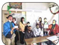
2022 December, Postcards to Sri Lanka

Since I started the role of International Cooperation Promotion Officer of JICA Fukushima Desk in 2022, I have been able to hold a "Satellite JICA Desk" every month. My job is to let as many people in the prefecture as possible know about JICA and the existence of the Fukushima JICA Desk. At first, it was a bit of trial and error, trying to figure out how to let the members to know about JICA, but when I saw people of different generations and types interacting with each other in such a fun way, my fears gradually disappeared. People from all walks of life visit AWIA. I decided to take advantage of this good thing and do what I could, without doing anything too complicated.