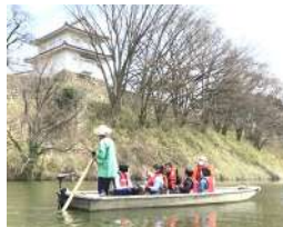
In Japanese only

Enjoy a historical boat ride in Tsuruga-jo Castle's moat! Riding the same boats used in the Misty Crossing in Mishima Town in Oku-Aizu, hear all about Aizu history and Tsuruga-jo from the boatman. Great for History lovers! (May be cancelled in bad weather)