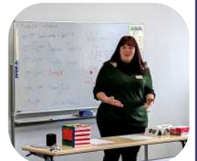
The first MEET, English Convo. Circle

I hope to be a part of this community for as long as I am able! I look forward to our time together!