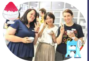
July 2024, fun at AtsuHana

From this AWIA event, I met people who helped pull me out of the darkness and into the warmth of the people of Aizu. I began joining other events hosted by the International Association, such as sports events (dodgebee, volleyball, etc) and FIND, English Club. Despite not living in Aizu at the time, my circle began to grow and with that, so did my opportunities to be involved in this amazing community.