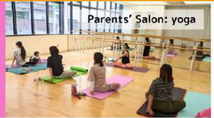
Parents' Salon: yoga