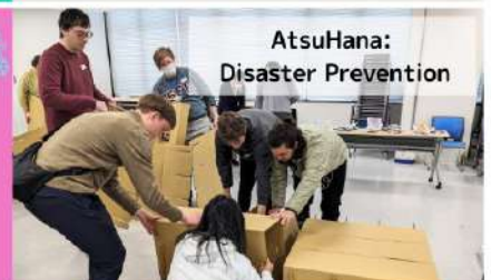
AtsuHana: Disaster Prevention