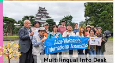
Multilingual Info Desk