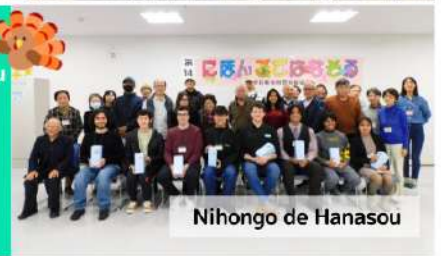
Nihongo de Hanasou