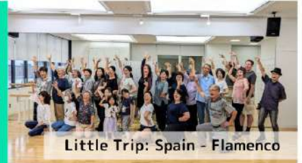
Little Trip: Spain - Flamenco