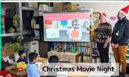
Christmas Movie Night