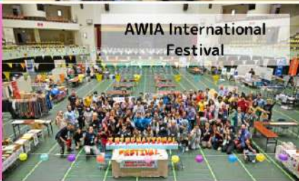
AWIA International Festival