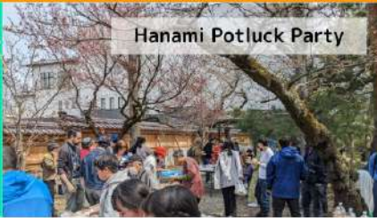
Hanami Potluck Party