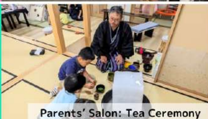
Parents' Salon: Tea Ceremony