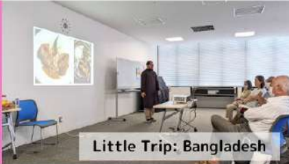
Little Trip: Bangladesh