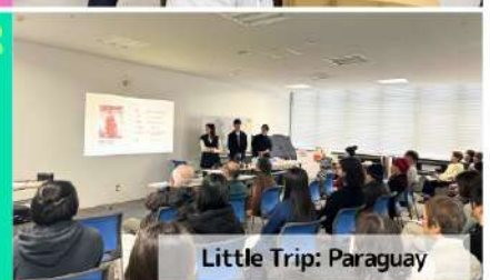
Little Trip: Paraguay