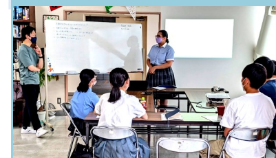
Seven students from Aizu, Aoi, Gakuho, and Xaverio High Schools discussed topics such as Gender Inequality, Racism towards Asian People, World Heritage Site Issues, Religious Conflict, etc.

I tried to speak to the students frankly. For better or worse, I often say what I think. There were a few students who have trouble talking with adults, so I was careful and I tried to say things like: 'I see where you're coming from, but—I think OO.' I wanted to listen to them carefully and answer honestly.