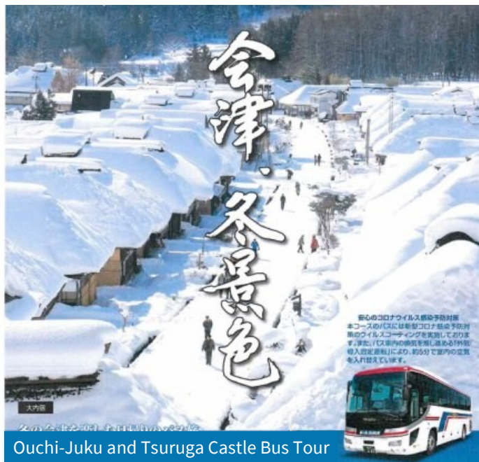
Ouchi-Juku and Tsuruga Castle Bus Tour