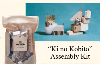
"Ki no Kobito" Assembly Kit

Our friends at Alte Meister have announced a special winter gallery and marketplace event! The gallery showcases original artwork and handmade items from the company's talented artisans, and the marketplace features a wide range of locally produced gifts and sweets, just in time for the holidays!