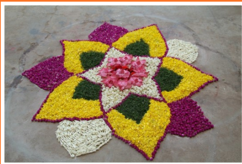
Rangoli made from flowers

Diwali is a major religious holiday celebrated throughout India and by Indian communities around the world. While Diwali may be most readily associated with Hindus, the holiday is also celebrated by Jains, Sikhs, and some Indian Buddhist sects. Diwali is celebrated over the course of five days, with the height of the festival occurring during the new moon after the traditional Indian harvest season. The night of the new moon is considered the darkest night in the Indian lunisolar calendar. This year, Diwali falls on November 14 th .