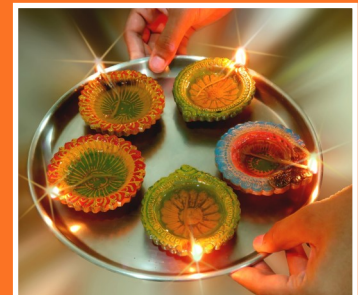
Diya Oil Lanterns

Last year, I was invited to celebrate Diwali with the Sikh community in my hometown. The outside perimeters of the Sikh temple, known as a gurdwara , were lit by diyas , and a trail of candlelight led from the temple to an outdoor pavilion where hot chai and a warm meal were served. A homemade vegetarian dinner was prepared for all guests by volunteers from the community, with dishes including vegetable pakoras, lentils, and sweets.